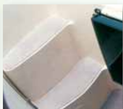
Marine carpet to fiberglass