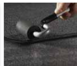
Rubber to metal