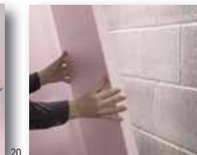
Polystyrene insulation to concrete block walls