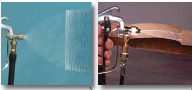
Wide web pattern for fast coverage and minimized overspray. Narrow web pattern for targeted application.