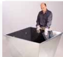
Insulation to metal ducting