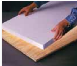
Polystyrene insulation to wood