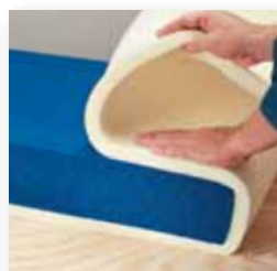
Foam to foam