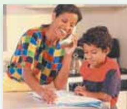
Countertops, cabinetry, shelves