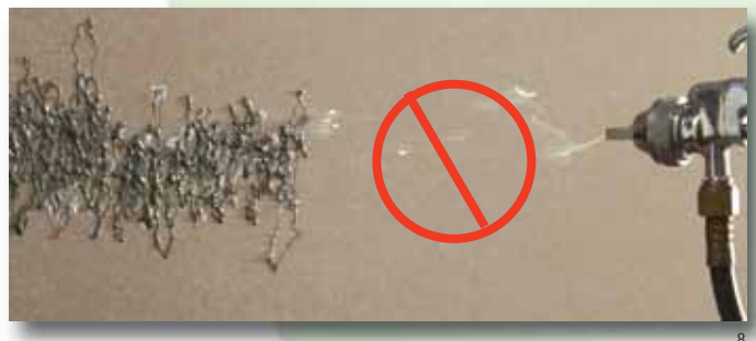
Controlled spray eliminates the waste of "fire hosing," puddling, and uneven stringing pattern (shown above).