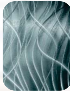
Reed (Directional pattern)