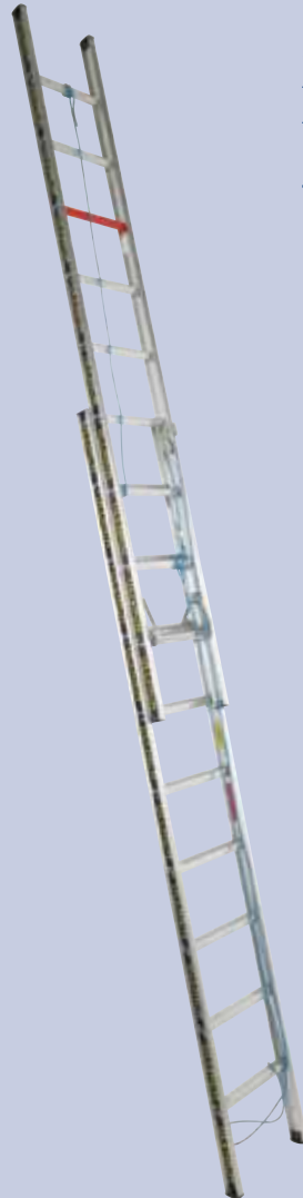
DE S3 Model

Ullrich Aluminium is very concerned that this invasion of unsafe products is continuing unabated and believes that the importation should cease at the earliest possible time.