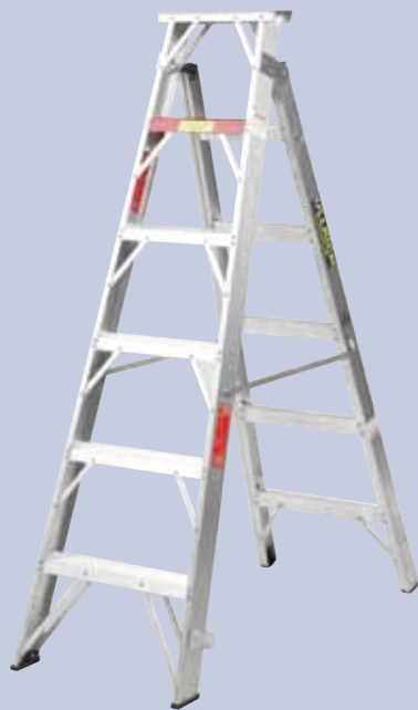
CS Model Combination Step Ladder